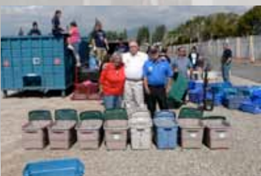
Hemet Elks Lodge continue to support the pull tab collection program