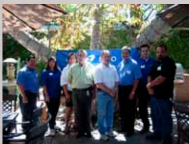
La-Z-Boy Employees prepared a fabulous BBQ salmon lunch for the families