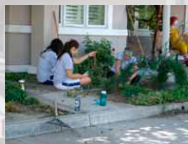
Gardening and housekeeping service project by University of Redlands Staff and Students