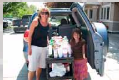
Cooley Ranch Elementary School collected coins in support of our Pennies from the Heart campaign