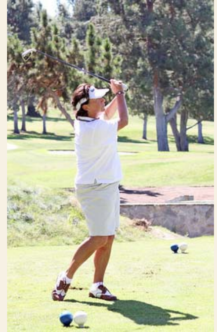
LPGA Hall of Famer, Amy Alcott offers a helpful swing to the golfers.